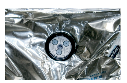
A moisture meter continuously monitors air humidity inside the packaging.