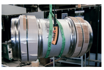
Prior to packing, the expansion joint will be cleaned with osmotic water.