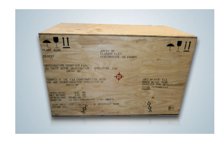
Every box is fitted with a shock indicator. This allows tracking of external effects such as the box falling down during transport.